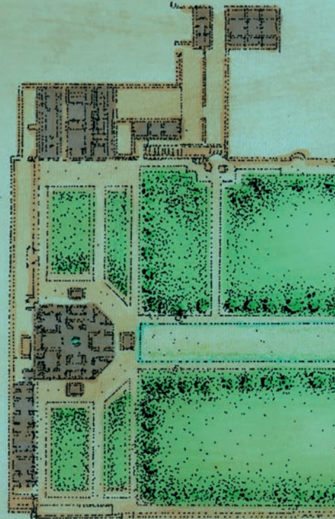
An Eighteenth-Century Plan of Bagh-e Dowlatabad, Yazd

This award is given to a self-made individual who has culminated his or her success through innovative philanthropic leadership, perpetuated the American Dream for others, and has given time and resources generously, inviting others to do the same.