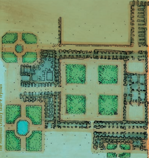
The Fifteenth Century Talare-e Teymurii

November 15, 2008 The Westin St. Francis Hotel San Francisco, California